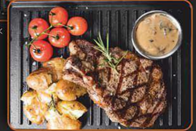
Al Bader's Special Steak